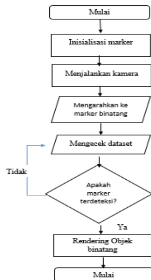
Figure 3.1 flowchart

The flow of implementation is seen in the flowchart below: