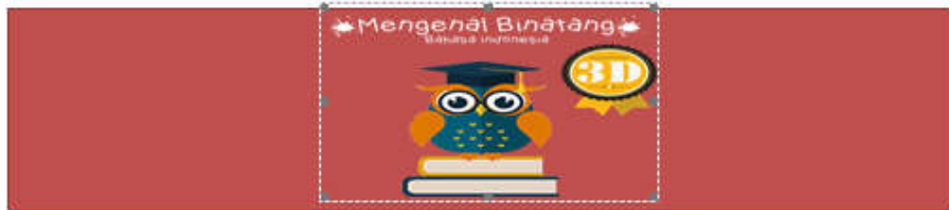
Figure 3.3 Splash Screen

Figure 3.3 Splash Screen is a graphical control element consisting of a window containing the current image, logo, and software version. A splash screen usually appears when a game or program is launched