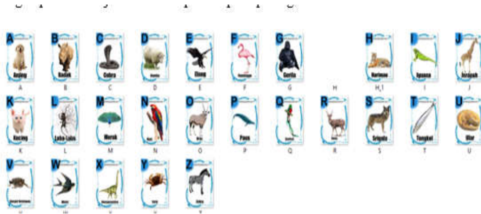
Figure 3.4 Marker

Figure 3.4 tag card marker containing the image pattern, so the application can detect the pattern and display 3d objects that have been previously set in unity.