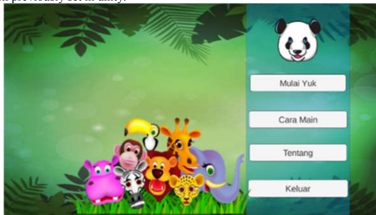
Figure 3.5 Menu

Figure 3.4 tag card marker containing the image pattern, so the application can detect the pattern and display 3d objects that have been previously set in unity.