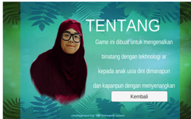
Figure 3.7 about menu

Figure 3.6 Way Menu When the user presses the button about the system will go to the page about which shows information about the purpose of this application is created and shown to whom this application is made.