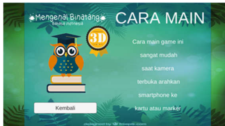
Figure 3.6 Way Menu

Here is a sub menu view, in the sub menu there is a button option start yuk to start the application Ar option how to play for tutorial use of the application, options about for application info and option out to exit the application as in Figure 3.5.